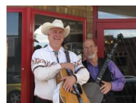
Blue Drifters Duet