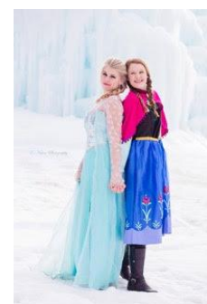
Frozen Anna and Elsa Thurs, Sat, and Sun