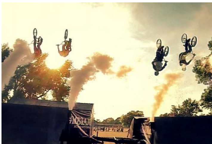
Bike Stunt Show: Wednesday and Thursday at various times---Win a Bike!

Bingo, Demonstrations, Garden Tours, and Much More!