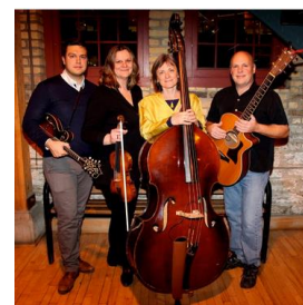
King Wilkies' Dream Band