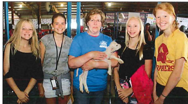
There's always a lot of excitement and smiles when a new baby animal is born at the Scott County Fair Miracle of Birth Center.

During the five days of the Fair, guests can witness the births of calves, kid goats, piglets, chicks, and lambs. Sometimes, there is standing room only at the Miracle of Birth Center -- but to make sure everyone can see the live births, there are large video monitors that make mother and baby the star of the show and allow Fairgoers to watch